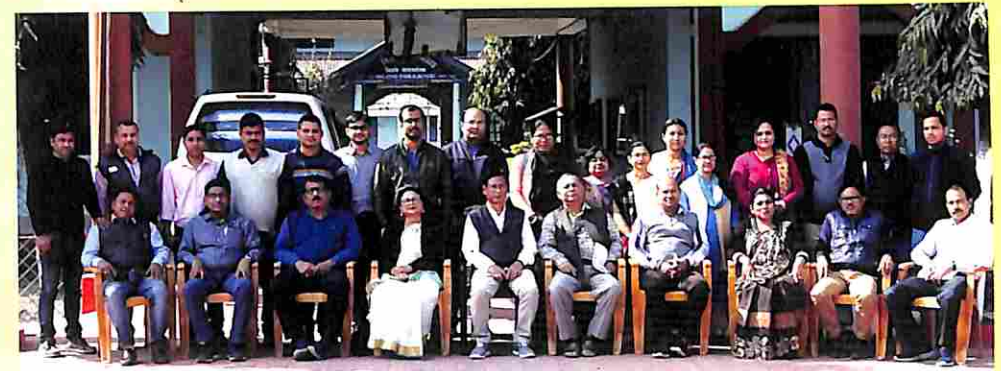
Teaching Staff of Bijni College