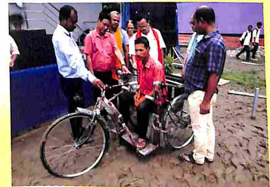
Appreciation to handicapped person