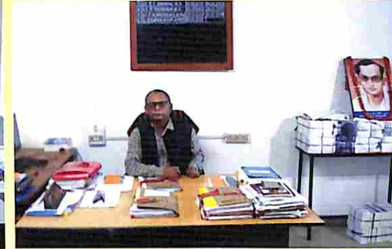
Vice Principal in his chamber