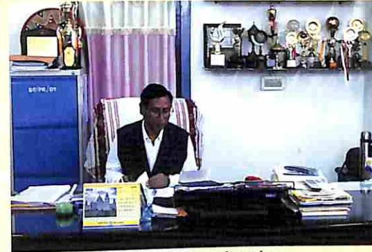
Principal in his chamber