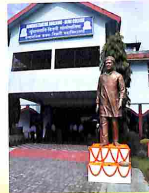
93rd Birth Anniversary of Dr. Bhupen Hazarika